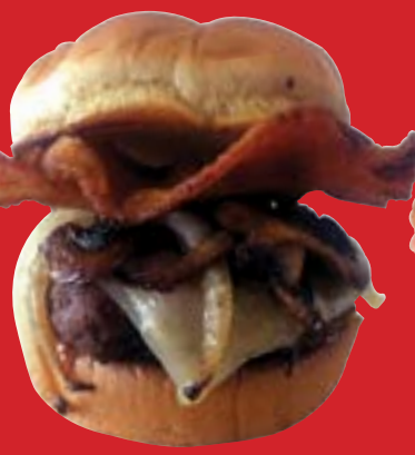
Cowboy Mushrooms, onions, bacon & Swiss cheese