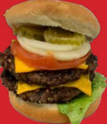
Big Rig Two patties, Creek Sauce, lettuce, cheese, pickles, tomato and onions

Burger Toppings: Swiss, Cheddar, or Pepperjack Cheese, Onions, Tomatoes, Jalapenos, Mushrooms, Pickles, and Bacon