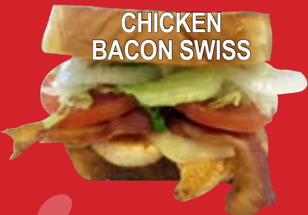
CHICKEN BACON SWISS