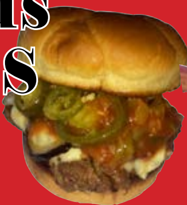
3-Alarm Pepperjack cheese, jalapenos, grilled onions & salsa

Build- A- Burger 1/2 lb. hand-formed patty with your choice of toppings and one side $12.99