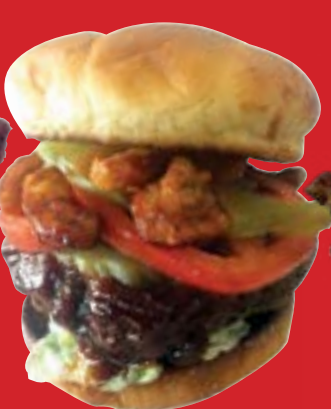
BBQ Onion straws, BBQ sauce, lettuce, tomato & pickles